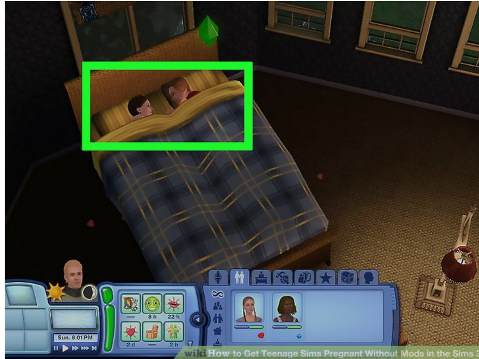
Sims 3 Figirl Repack